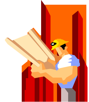
A new format for the CA Outdoor