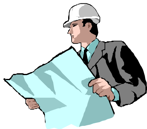
Reorganizing SAC for the future