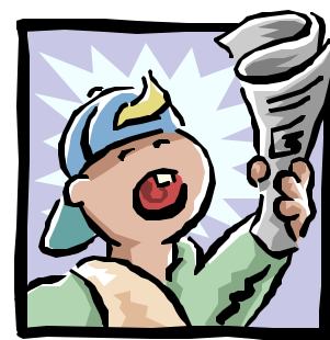
New news from the NAA

“The proposal in a nutshell will extend the dates from the last two (2) weeks in February to the first two weeks in March”