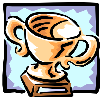
The Karl Radde Award An award unique to the State of California.

“State Archers of California honors archers who make significant achievements in and for the sport.”