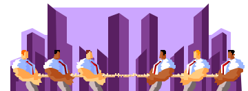
Remember to pull past the sound of your clicker