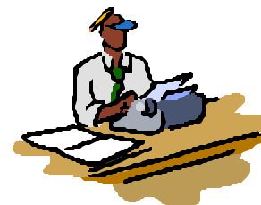
Newsletter starts up with new organization

This requires your participation – write a small article on your club, your JOAD club; be the contact for club news; write a letter to the editor; give us your input and your feedback.